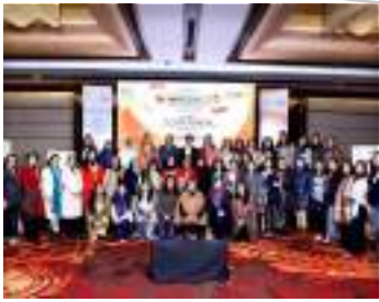
FLO Jammu Kashmir & Ladakh