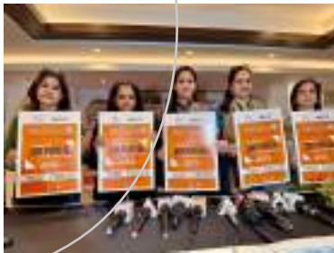
FLO Jammu Kashmir & Ladakh